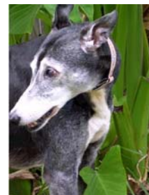
Magic celebrated her 16th birthday on July 25th. She was adopted through Heart of Texas Greyhounds and currently resides in Houston, Texas.

http://www.4greyhounds.org/2004GHCelebration.html